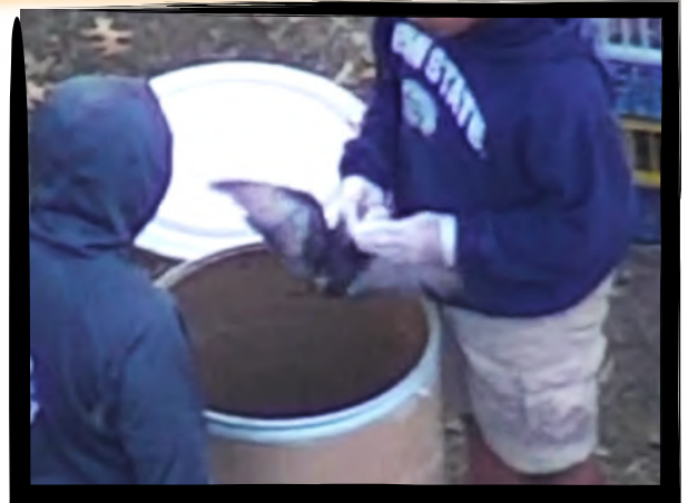
Children are often used to capture and kill wounded birds at pigeon shoots

The main pigeon shoot SHARK focused on in 2022 was the notorious Philadelphia Gun Club. SHARK investigators filmed a shoot at the gun club in April, capturing horrific acts of animal cruelty and a complete disdain for human life, as the wealthy and politically connected members of the gun club openly flouted cruelty laws. These sociopaths just didn't care about anything other than slaughtering small birds for fun.