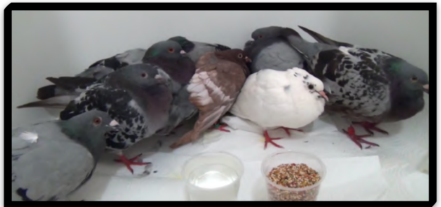
Just some of the many dozens of wounded pigeons SHARK has rescued over the years at pigeon shoots