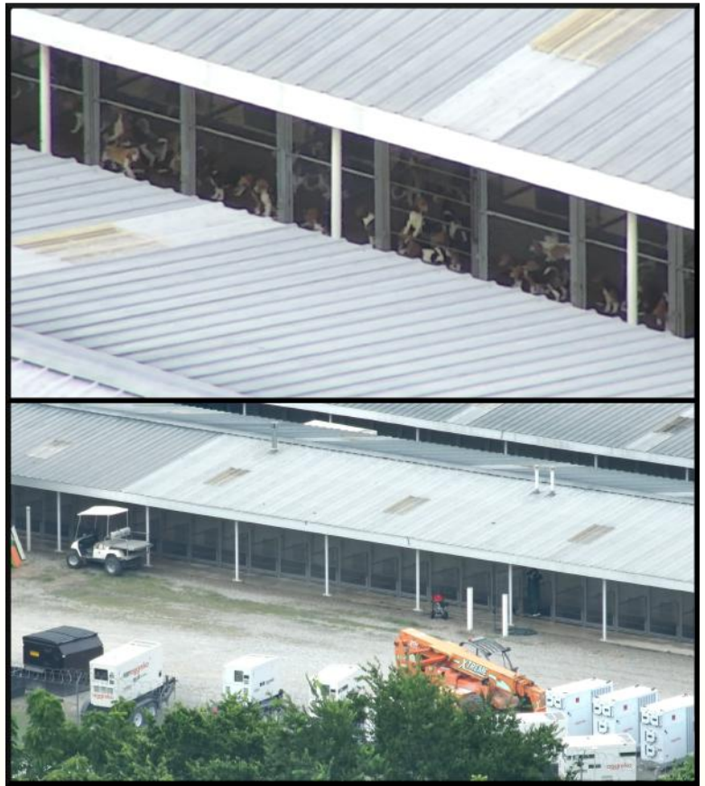
Top photo of Envigo before, and below the empty cages after!

It took five years, but SHARK's drone footage ignited a movement that culminated in almost 4,000 dogs being rescued and placed into loving homes, and the shutdown of an evil dump.