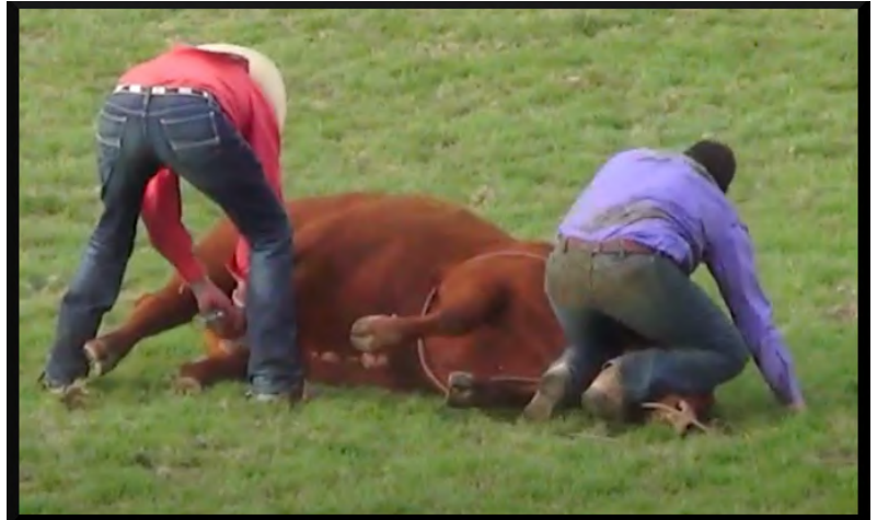
A terrified cow being forcibly milked during the "Wild Cow Milking" event at a rodeo in Alameda County, CA

Thank you to everyone who helped to make this possible for the brutalized and terrified cows!