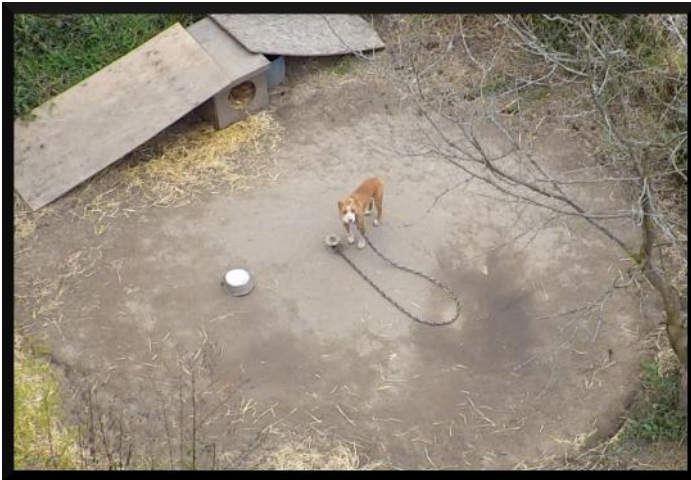
SHARK documenting an Illinois pitbull operation