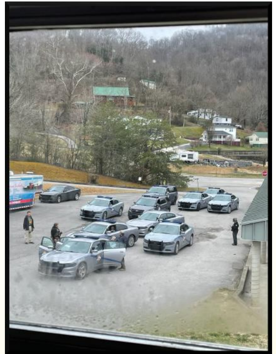
Federal Bust of Kentucky Cockfighters

SHARK and the Humane Farming Association's efforts against cockfighting are resulting in shutdowns, lawsuits, federal busts and convictions. Kentucky, Oklahoma, Illinois, California, Alabama, Ohio, Texas and more states are feeling our efforts directly, and the ripple effect of our efforts is shaking up the illegal cockfighting industry throughout the nation and beyond.