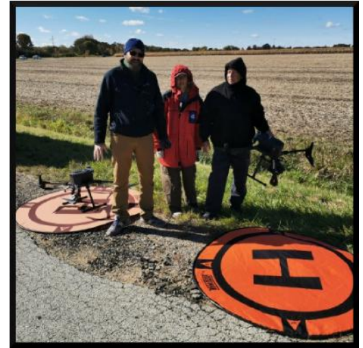
SHARK using drones to document a November 2022 Boone County, IL Mexican Rodeo