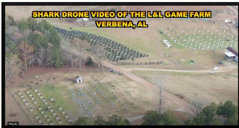
A small part of Easterling's criminal operation