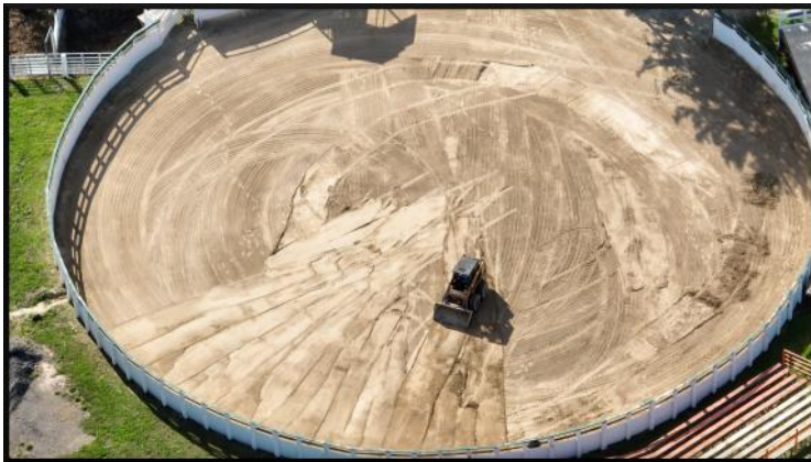
Arena being prepared for a Boone County, IL Mexican Rodeo "Steer Tailing"

There are literally hundreds of cruelty violations at these rodeos. Unfortunately, laws are only as good as the people behind them, and the lesson that is undeniable is that Illinois, in the final analysis, is not much better than Kentucky. We aim to change that, and I promise you that in a year this situation will look very different, as we have started a campaign to ban steer tailing not just in Illinois, but nationwide.