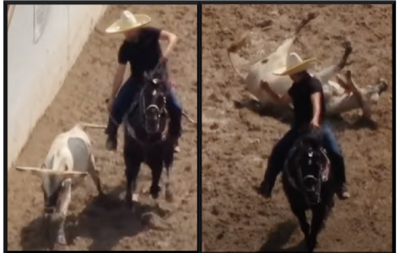
Steers are repeatedly abused during a Boone County, IL Mexican Rodeo in a "Steer Tailing" event

In an October rodeo, one paralyzed steer was dragged out of the arena by his horns , and even this profoundly injured animal was left to suffer. Adding to the cruelty, were the contestants mercilessly beating their own horses for failed runs in which it was those contestants, not their hapless steeds, who failed to perform!