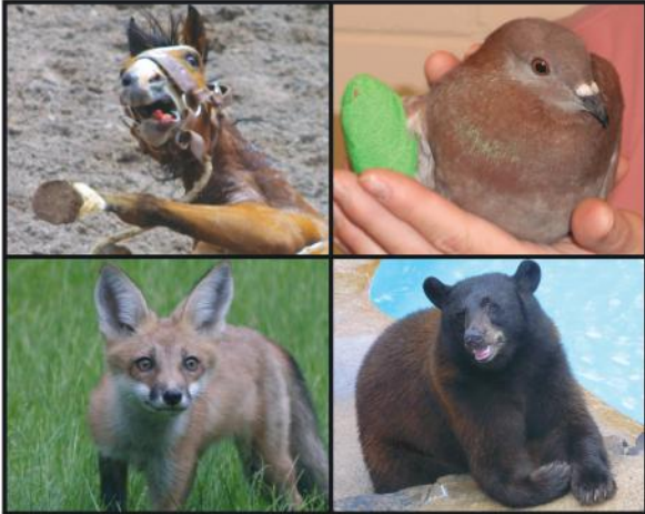
Dedicated to ending the abuse and suffering of animals everywhere