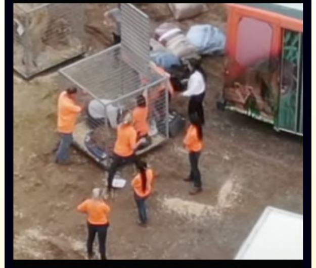
SHARK's drone video of tigers at the Lowe Zoo, followed by the removal of big cats from the zoo